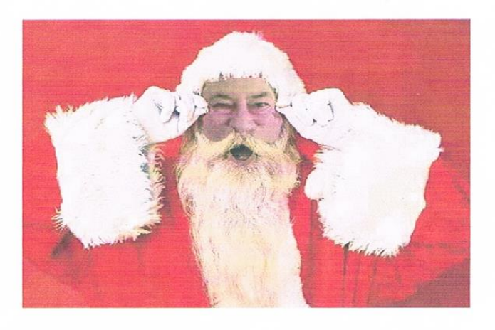
RSVP: Club Notice board or Nigel by the 3<sup>rd</sup> December for catering purposes Payment to the treasurer please