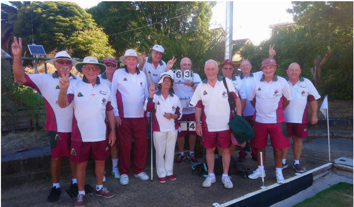
The Victors – 66-47